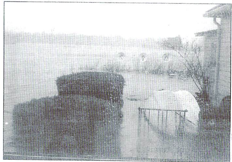
At noontime Saturday, high tides combined with stormy weather to cause flooding in several South Shore towns, including Duxbury. Water came over the town pier, and breached the Blue Fish River Bridge, but receded without causing any major damage. The extended forecast continues to call for more rain and snow.